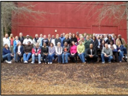
2010 CPM class members at Capstone retreat.

To earn the nationally recognized CPM management credential, participants must complete 300 hours of coursework, pass written examinations, and apply their knowledge by completing a project related to their agency. The CPM program targets the competencies public-sector managers and leaders need to perform successfully in the government environment and helps them develop skills in management, leadership, and process improvement.