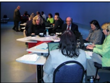
Members answering calls and taking donations.

Oklahoma City, Oklahoma Mark the date! http://events.oucpm.org/aacpm-conference/